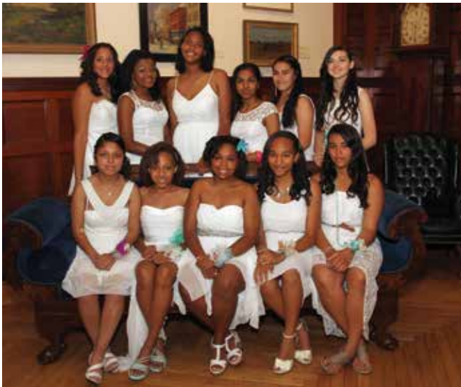
Our Sisters' School Class of 2013

After five years as a school, Our Sisters' School, an independent, tuition-free middle school for the girls of Greater New Bedford sails on and celebrates continued growth and success.