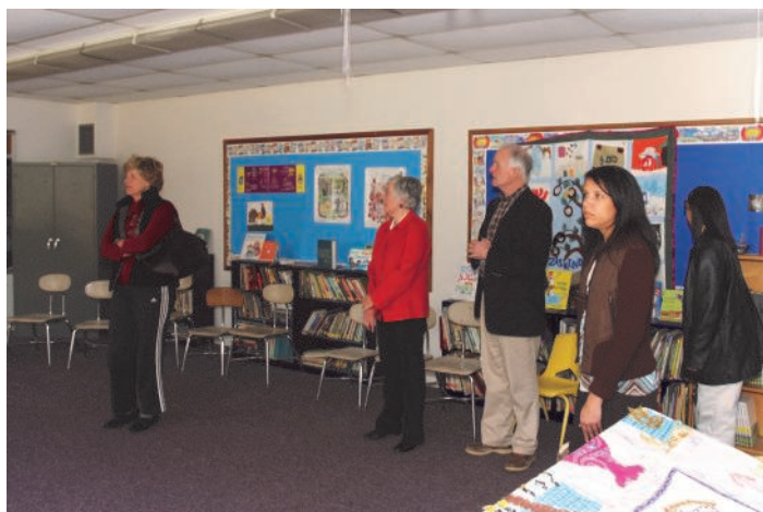
OSS Board Members tour the new school.